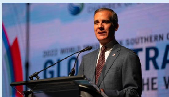
2022 WTW Image Gallery