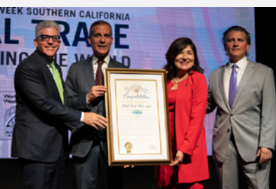
WTW 22 Leadership

Learn About the History of World Trade Week