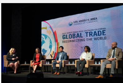
WTW 22 Discussion Panelists