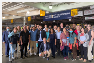
WTW 22 Education Committee Event Tour of Delta Cargo Hold