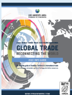
2022 WTW Info Guide