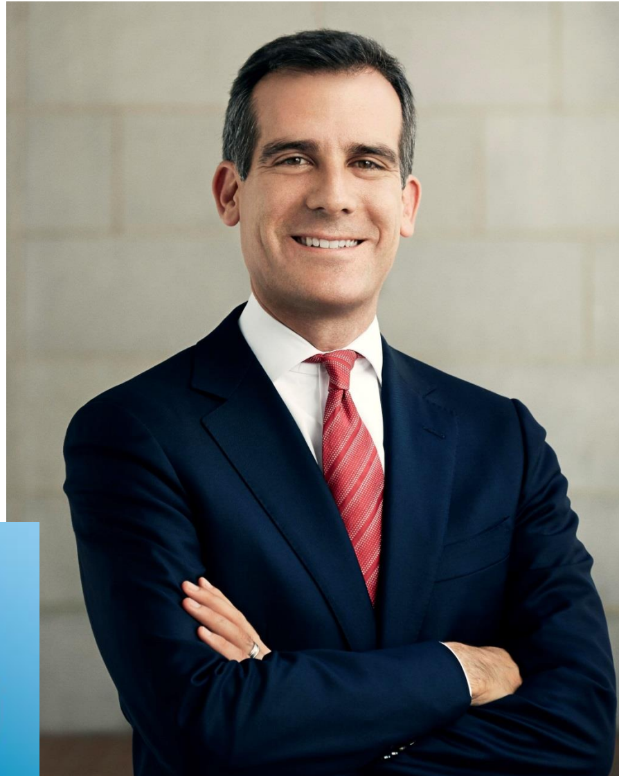
Eric Garcetti #lamayor