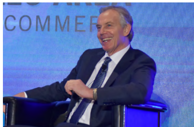
Tony Blair, Former Prime Minister, Great Britain and Northern Ireland