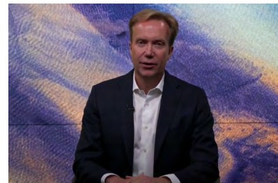
Børge Brende President, World Economic Forum