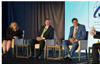
Panelists from: McKinsey Global Institute, FedEx Logistics, Yusen Terminals, Beacon Economics