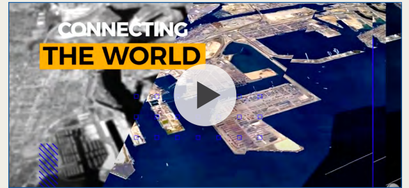
About World Trade Week

The Chamber kicks off the start of each year's celebration by bringing together business executives, regional leaders and members of the diplomatic corps for the WTW Kickoff Breakfast. The event, which attracts 900 participants consists of an insightful program featuring c-suite level keynote speakers and industry experts to share their insights on the latest global trade trends impacting So Cal companies. The conference also includes scholarships, industry awards and an interactive exhibit.