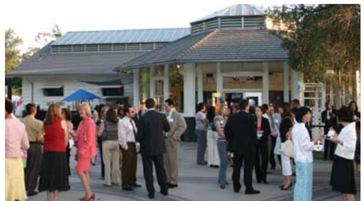
MIXING IT UP. Chamber members mingle at the Chamber's Summer Business After Hours Mixer at Kidspace Children's Museum in Pasadena.